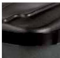
Steel-reinforced Rugged Rim for impact resistance