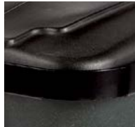
Steel-reinforced Rugged Rim® for impact resistance