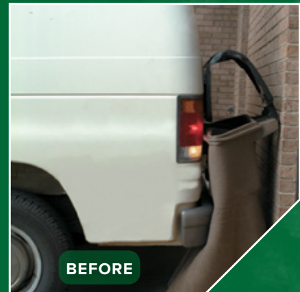
Toter carts are extremely impact-resistant - they flex, but don't break.