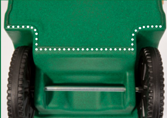
Toter carts feature a heavy-duty wear strip to withstand dragging across rough surfaces.

There's no other curbside collection cart that's built to last quite like a Toter. Constructed using Toter's Advanced Rotational Molding™ process, Toter carts are built to keep working long after others fail - more than 2x longer. They're backed by a 12-year body warranty, the best in the industry. Toter carts are extremely flexible, impact-resistant, and easily handle the day-to-day abuse of curbside waste collection.