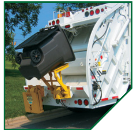
Toter carts are compatible with both fully automated arms (left) and semi-automated lifters (right).