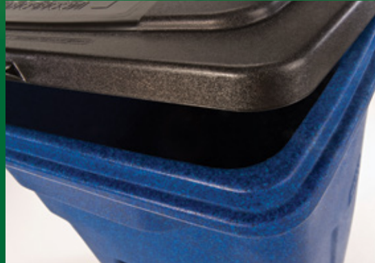
Only Toter carts have a Rugged Rim® to extend the life of the cart.