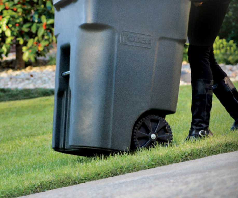
Toter carts are easy to tilt and roll to the curb.