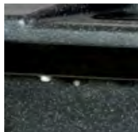
Steel-reinforced Rugged Rim for impact resistance