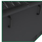
Optional comfort & grip handles for easy maneuverability