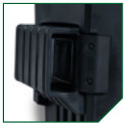
Replaceable, double-walled lift pockets for easy maintenance