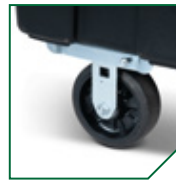
Replaceable double-walled bumpers for long-lasting durability