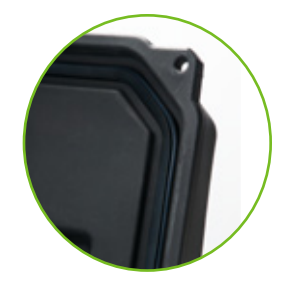
Strong double-walled lid provides two layers of security