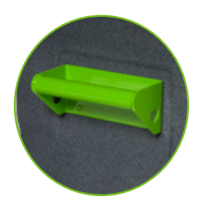
Secure metal latch