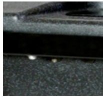
Steel-reinforced Rugged Rim® for impact resistance