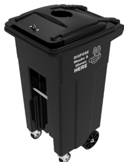
Caster Carts Dispose of masks and gloves into a PPE specified 4-wheel cart

Toter's Caster Carts are ideal for disposing of masks and gloves with specified signage. Added caster wheels eliminate the need to tilt the cart to roll, helping stabilize heavy loads.