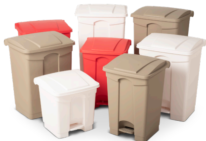
Step-On Containers Offers hands-free disposal

Toter's Step-on Containers provide an easy way to dispose of waste and recyclables with an integrated foot pedal for easy, hands-free lid opening. Available in multiple colors including beige, white, and red. Ideal for use in a variety of settings.