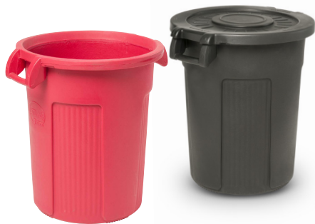
Atlas Round Can Heavy duty, large volume container for medical waste

Toter's commercial-grade, large-capacity cans are built to last. Only Toter offers Rugged Rim® technology for added strength in critical-wear areas, and with a revolutionary Advanced Rotational Molding™ manufacturing process, round garbage cans will stand up to the toughest environments imaginable.